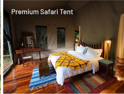
Premium Safari Tent