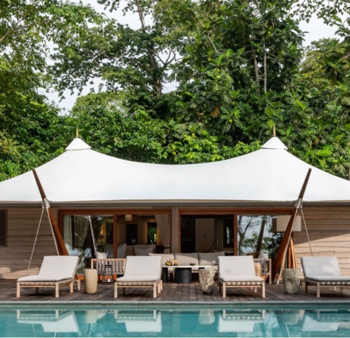
1 Bedroom Tented Villa