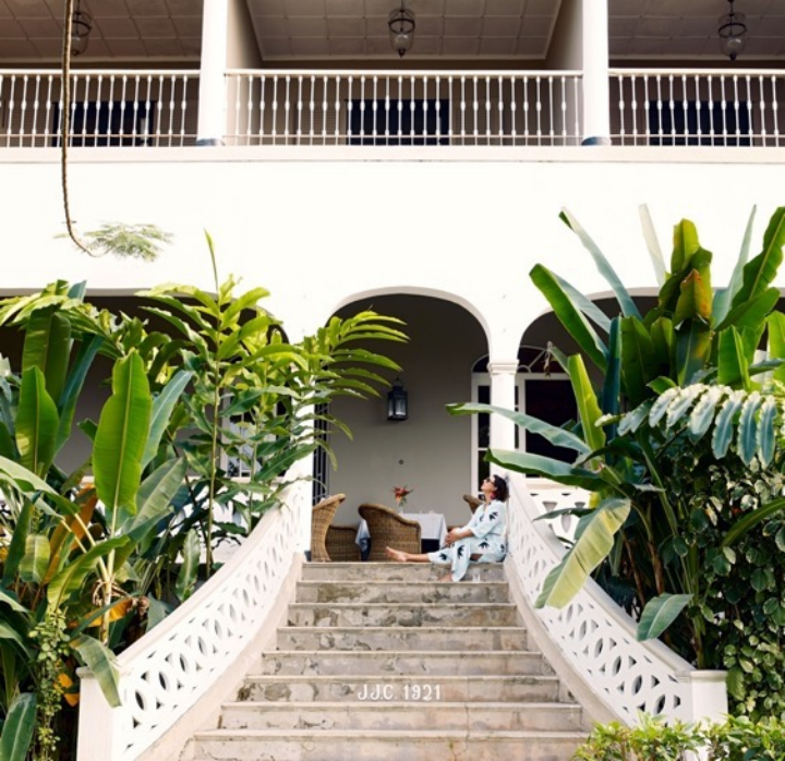
Roça Sundry Eclipse House